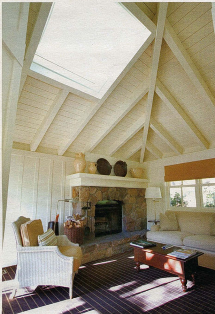
Meadowood, just outside St. Helena, spreads over 250 secluded acres and features well-appointed cottages, a nine-hole golf course and a spa.

Meadowood's signature restaurant is one of the valley's top destinations. The handsome dining room, with its white-beamed ceiling and dark wood highlights, is timelessly elegant, while the prix fixe menu follows the seasons, relying on the resort's large garden. The Best of Award of Excellence-winning wine list, an outstanding collection of 950 bottles, emphasizes Bordeaux, Burgundy and California.